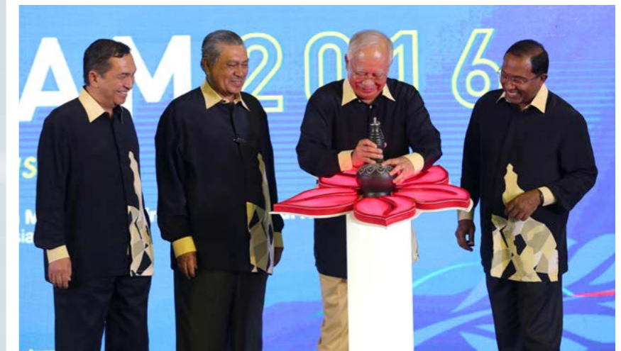
Launch of MSAM 2016 in Tapah, Perak