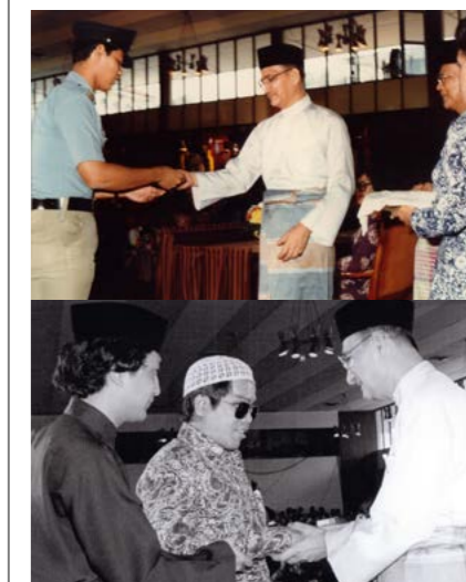
ASN unit holders receiving their passbooks from Tun Hussein

During the launching of Yayasan Pelaburan Bumiputra (YPB) and Permodalan Nasional Berhad (PNB) on 14 April 1978, he remarked, “YPB and PNB have been established to assist the Bumiputera community to acquire shares in fulfilling the objective of the New Economic Policy. A management which is truly honest, responsible and dedicated is key in attaining success of the YPB and PNB objectives.” At the launch of PNB’s first unit trust scheme, ASN on 20 April 1981, Tun Hussein emphasised that, “This scheme has the national interest at the forefront to achieve the objectives of the country. No one should ever be doubtful of the pure intention of the scheme, moreover the Bumiputera themselves.” Tun Hussein was also the first registrant of the scheme. For his efforts in promoting goodwill among the various communities, Tun Hussein is remembered as the Father of Unity.