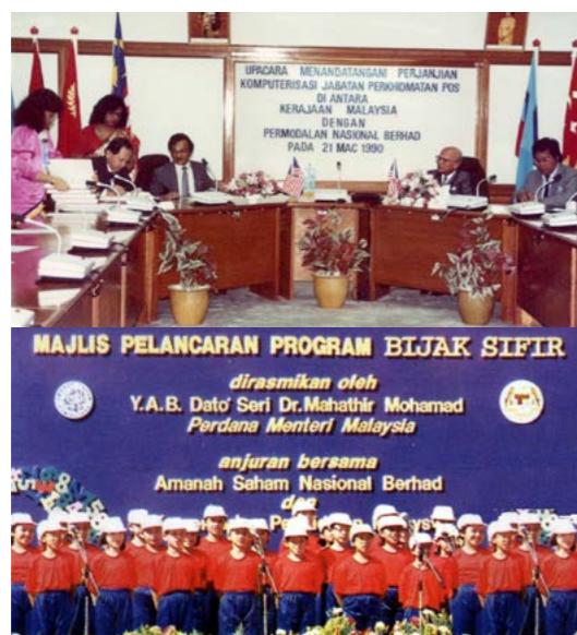
"Program Bijak Sifir" was launched in 1994 to encourage primary school students to enjoy mathematics