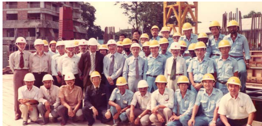
Tun Ismail at the ceremony to erect the first steel column for Menara PNB on 26 October 1982